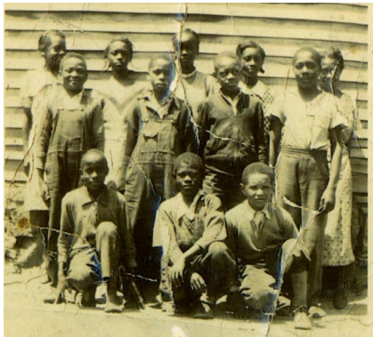
Academy Hill Boys circa 1930