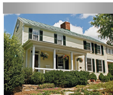
Israel Christian House

“HONOR HISTORY, ENJOY THE PRESENT AND SHAPE OUR FUTURE”